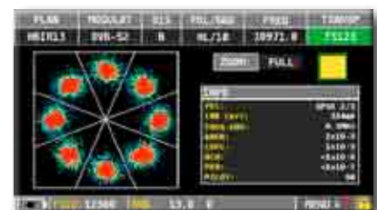
DVB-S2 multistream Constellation 8PSK mod., on the right relative modulation parameters & ISSY