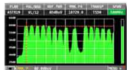
Satellite spectrum with 500 MHz SPAN