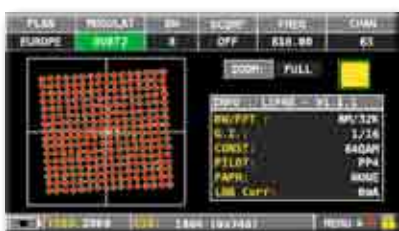
DVB-T2 rotated Constellation 256 QAM mod., on the right relative modulation parameters & M-PLP