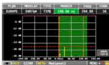
ECHO MEASUREMENT in SFN networks, with impulse response in real time, green area shows the guard interval